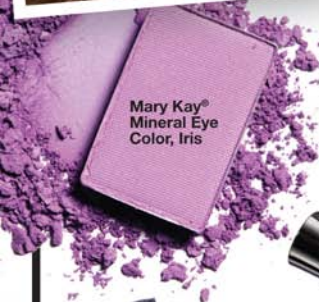
Mary Kay® Mineral Eye Color, Iris