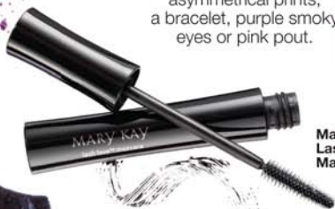
Mary Kay® Lash Love™ Mascara